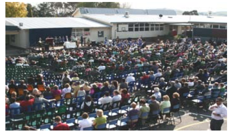
Part of the growing crowd at the Opening.