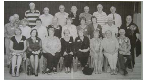
1958 students and staff.